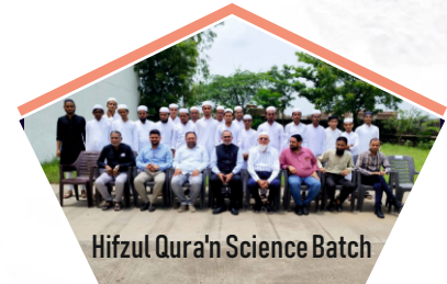
Hifzul Qura'n Science Batch